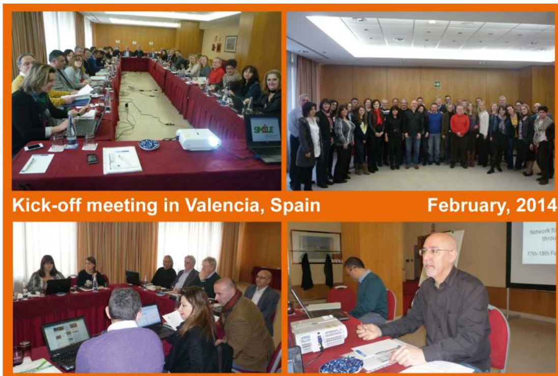
Kick-off meeting in Valencia, Spain

The Network for Social and Market Inclusion through Language Education (SMILE) gives you the answer!